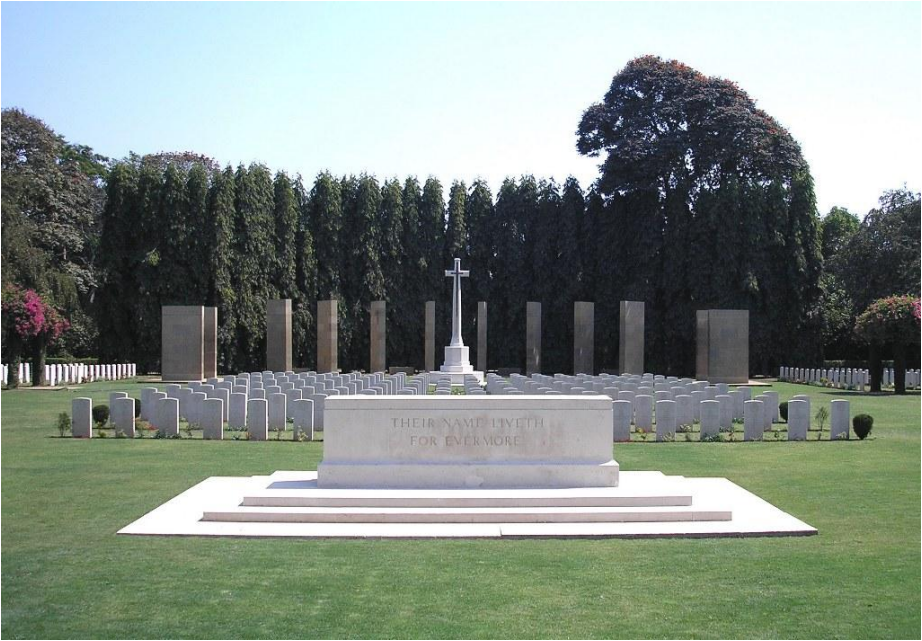
Above: Cross of Sacrifice at Kirkee War Cemetery, India